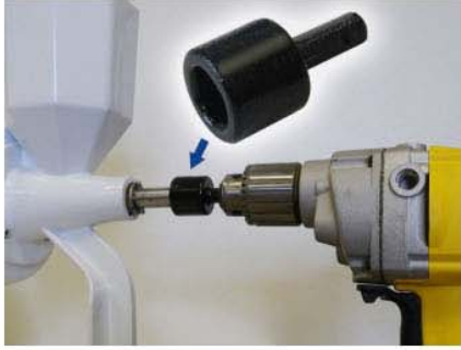
Drill Adapter #70-WJDA