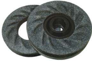
Stone Milling Heads #70-WJSTONE