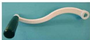
Handle Assembly #70-WJHANDLE

Parts marked with a * are only included with the DELUXE model, not the BASIC model.