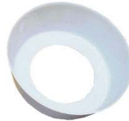
*Flour Guide #70-WJFG