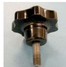
Adjustment Knob #70-WJADKNOB