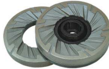
*Stainless Steel Burr #70-WJBURR