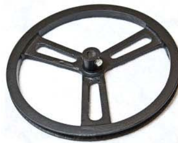
Motorizing Pulley #70-WJMP