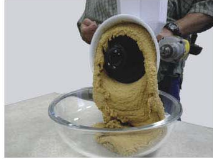
Great for Nut Butters