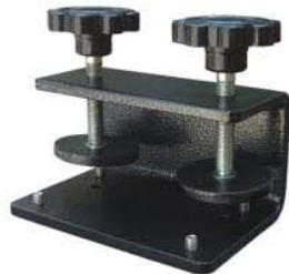
*Double Clamp #70-WJCLAMP